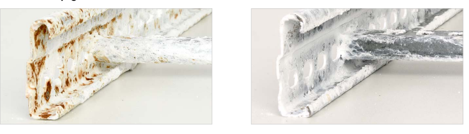
Z4 – 1050 h